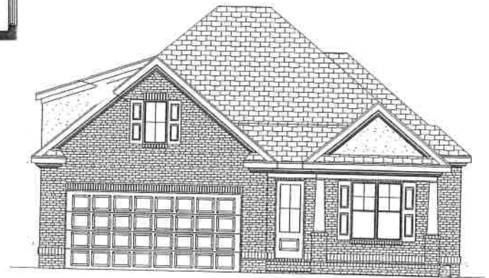
PAISLEY "B PLAN"